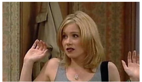
[Photos] "Married With Children" Scenes We Simply Can't Take Our Eyes Off Bob's Hideout