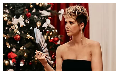
Netflix Announces Binge-Worthy December Lineup Refinery29