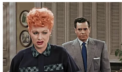
[Photos] The Last Photo Of Lucille Ball Is Heartbreaking History 101