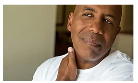
Symptoms of Head and Neck Cancer HealthCentral