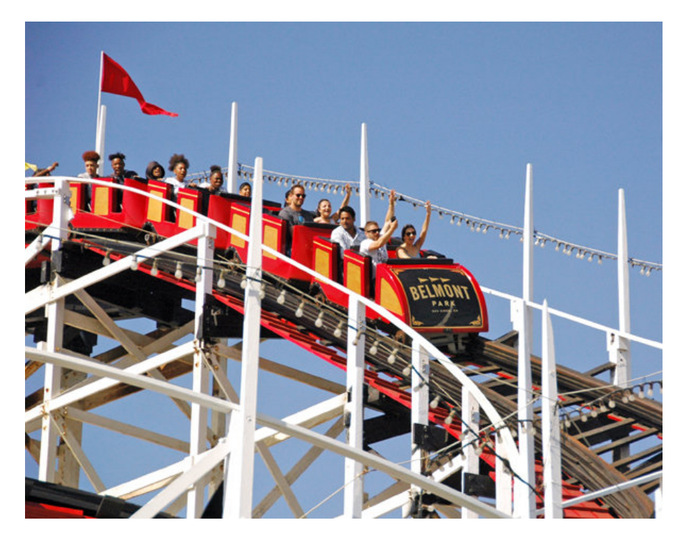
People ride the Giant Dipper roller coaster at Belmont Park on Sunday, May 27.