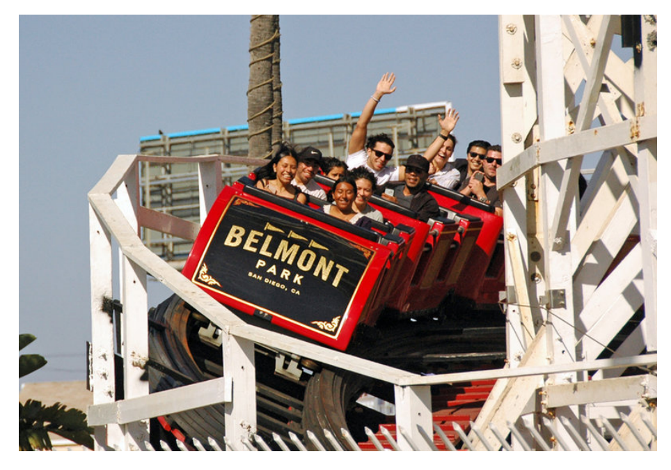
People ride the Giant Dipper roller coaster at Belmont Park on Sunday, May 27.