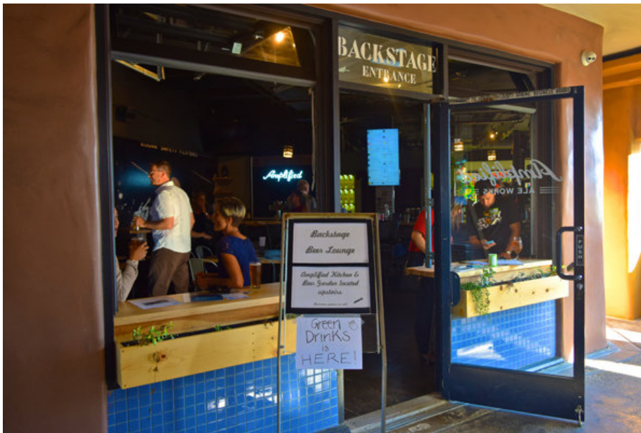
Amplified Backstage is located at 4150 Mission Blvd., Suite 105, just below Amplified Ale Works Kitchen & Beer Garden.